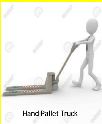
Hand Pallet Truck