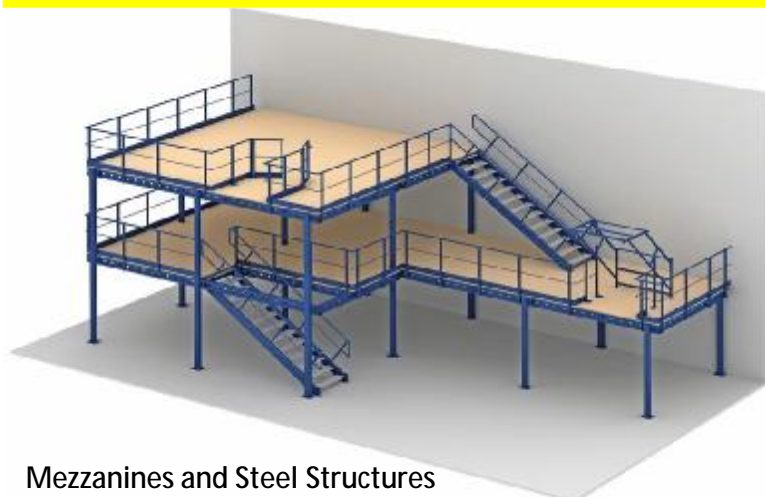
Mezzanines and Steel Structures