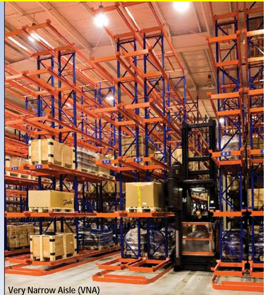
Very Narrow Aisle (VNA)