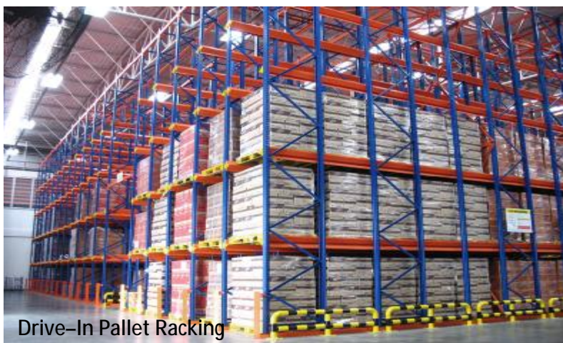
Drive-In Pallet Racking