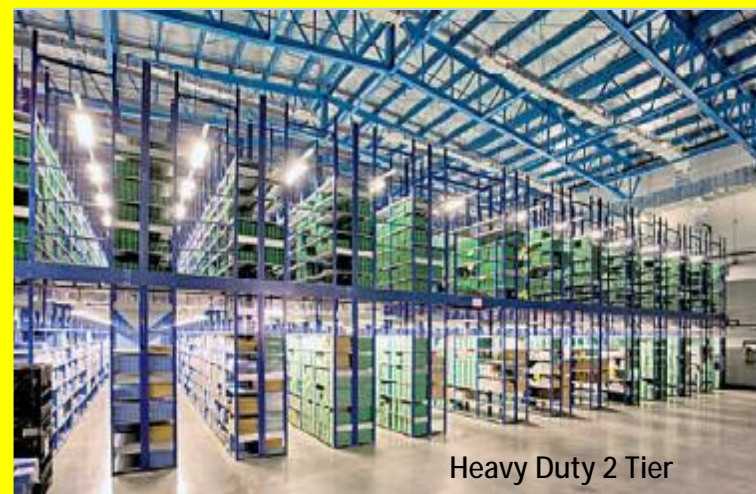
Heavy Duty 2 Tier