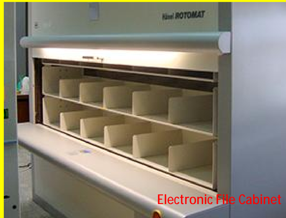
Electronic File Cabinet