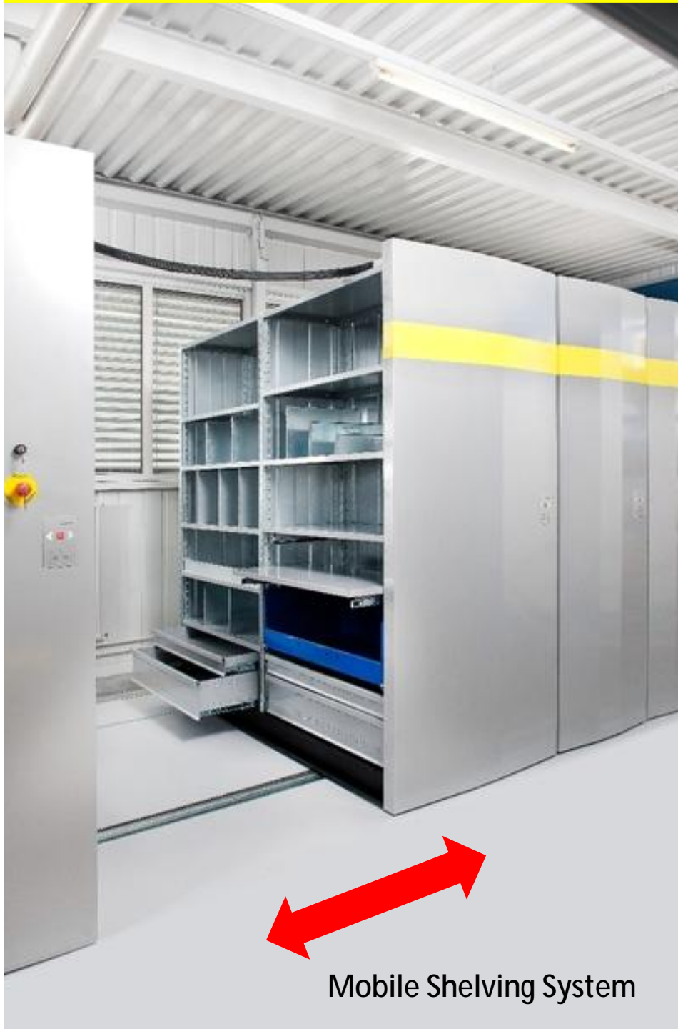
Mobile Shelving System