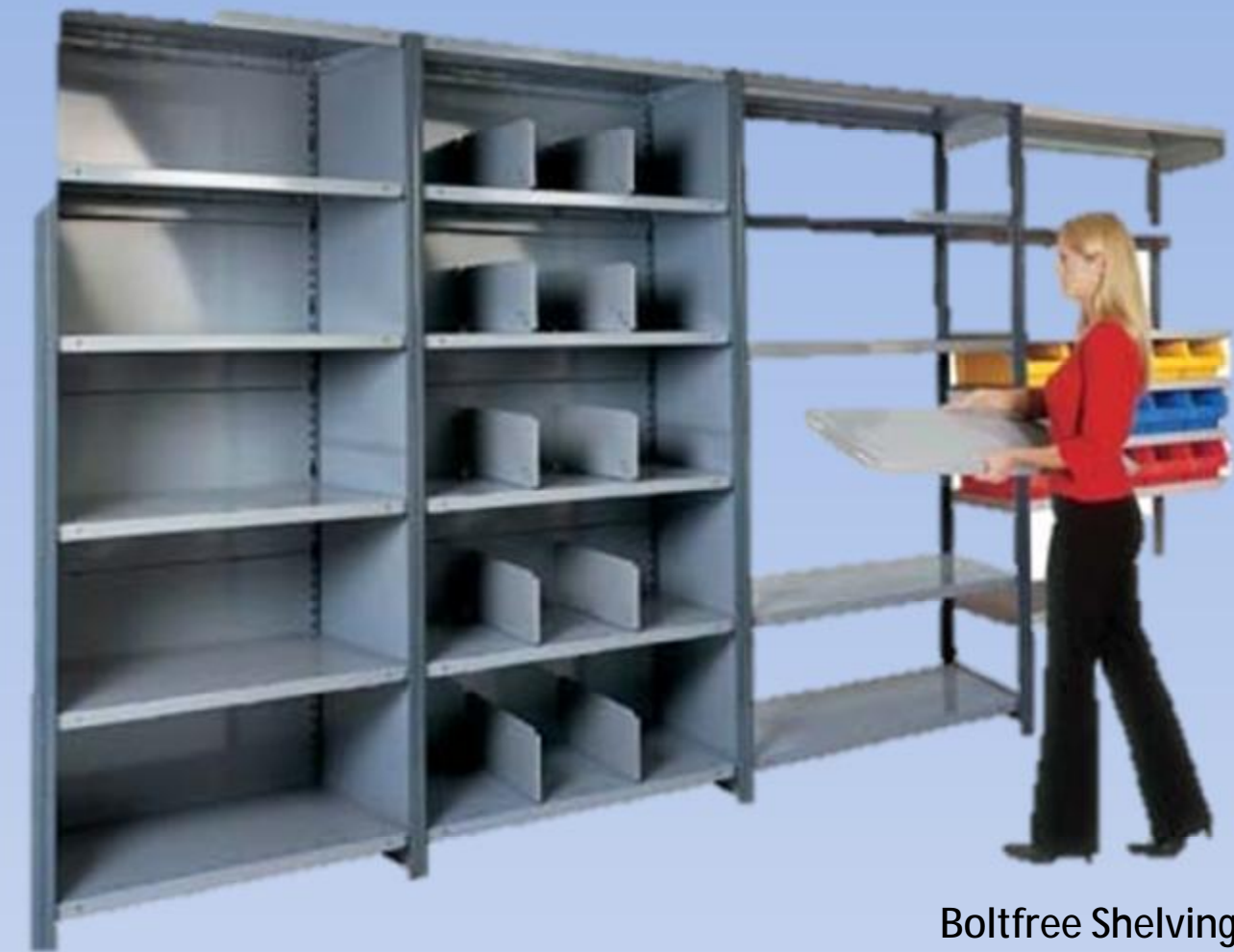
Boltfree Shelving System