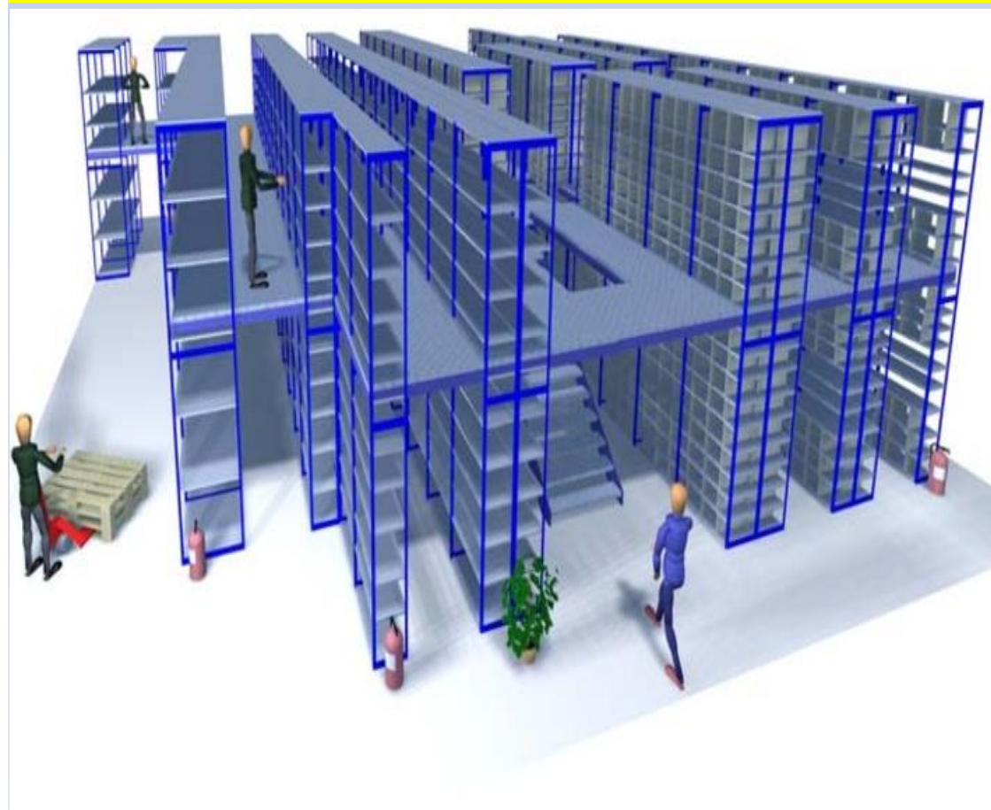
Multi Tier Slotted Angle Racks