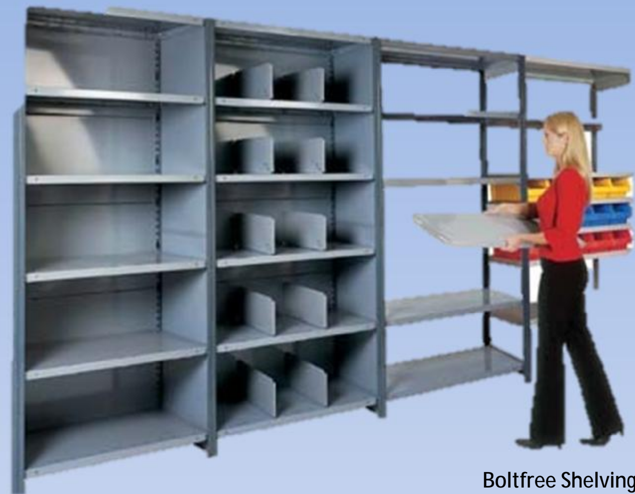
Boltfree Shelving System